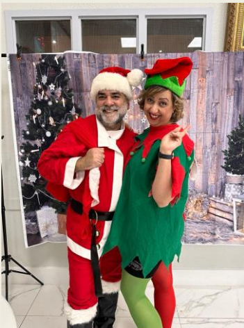
Santa Claus and his Elf!

The ZSO venue was transformed into a winter wonderland all thanks to the volunteers who played a crucial role in ensuring the event was seamless. They helped in the kitchen to cook the delicious meal from 8:30 a.m. and were also dressed up as Elf and Santa for the photo booth. Anyone could click a picture with them for $2. The proceeds of the same would go towards fundraising for the Scotland Jamboree 2024.