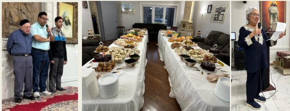
Volunteer Appreciation on December 2nd