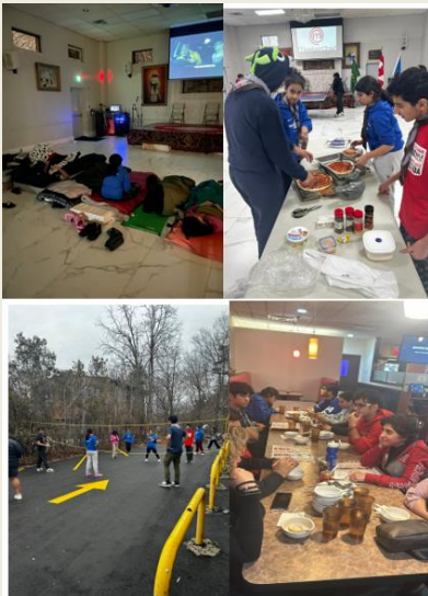
Scouts doing various outdoor and indoor activities

Overall, this year's ZSO camp stands as a testament to the success of the Toronto Scouts' endeavors. Beyond its role as a cherished tradition, the event serves as a prelude to upcoming fundraising initiatives. These efforts are aimed at supporting the upcoming Jamborette in Scotland next summer, further reinforcing the scouts' commitment to growth and global connections.