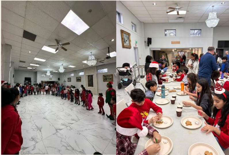
Scouts kick off the Christmas party with the regular flag ceremony, then jump into Christmas decorative activities

One of the highlights of the afternoon was the Christmas gingerbread cookie decoration activity organized for the beavers and cubs. The creativity of beavers and cubs decorating the cookies and Christmas music created a festive ambiance truly capturing the Christmas Spirit.