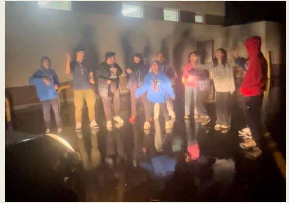
Impromptu rain dance outside the MGDM

Sunday morning ushered in a collective sense of exhaustion, prompting the decision to wind down camp activities. Scouts rallied to clean up, pack their belongings, and close the camp, enjoying a tranquil period of relaxation until pick-up.