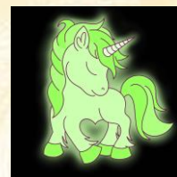
Love Story Unicorn #11 available on Open Seas