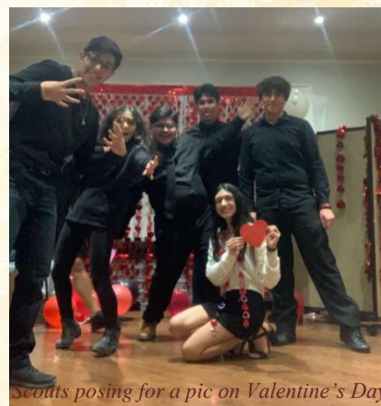
Scouts posing for a pic on Valentine's Day