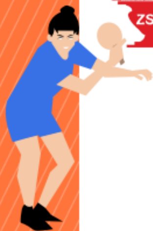
TABLE TENNIS MONDAYS!

EVERY MONDAY FROM JANUARY 23, FROM 7 TO 8:30PM