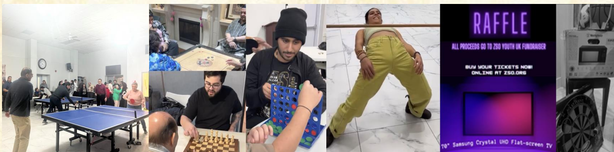
Games including chess, limbo, table tennis and carrom