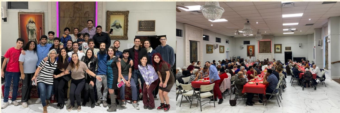
Volunteers gather for volunteer appreciation dinner

It was an honor to attend the Cardinal dinner representing Zoroastrians as part of the Interfaith Group. This dinner was attended by over 1300 people and several high-level politicians as a fundraising event for various charities. We are still looking for a volunteer chair for the Interfaith Committee. Please contact me personally ( president@zso.org ) if you are interested in discussing this position.