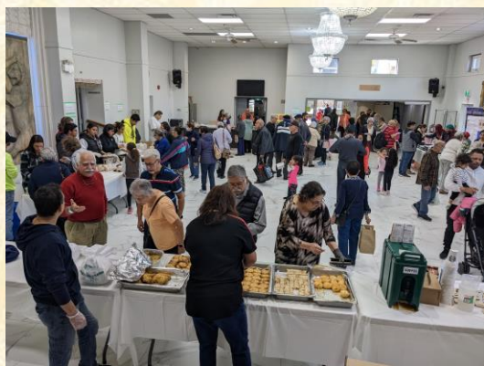
Full house at the Darbe Mehr