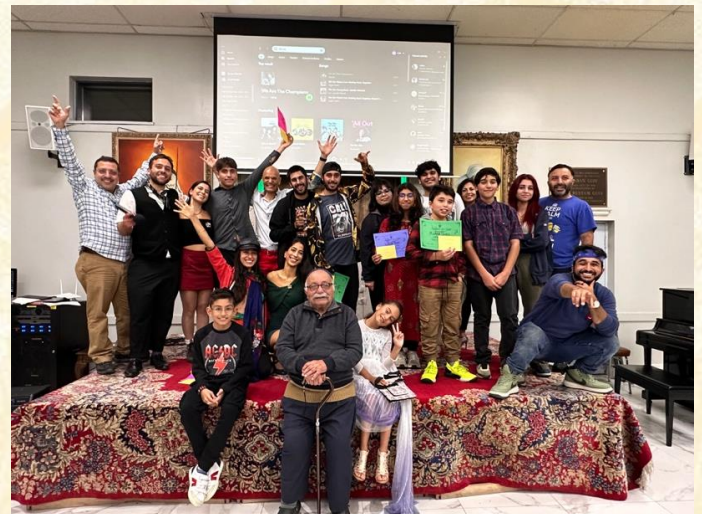
Participants posing for a group picture, what community is all about

Instagram - ZSOYOUTH and Facebook - ZSODM