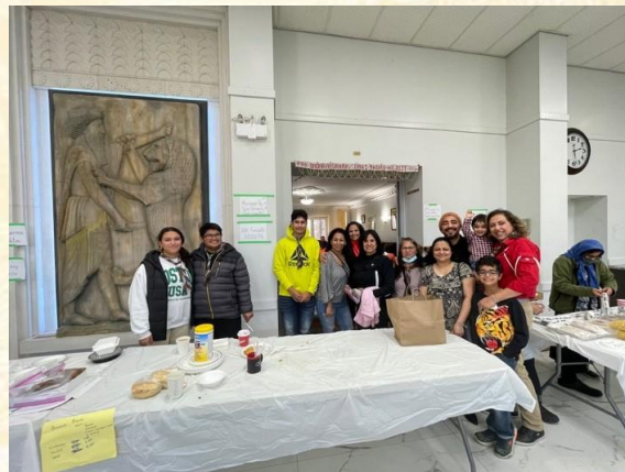
100 Toronto Scouts Group at their table after selling out!

Thank you to all the vendors and shoppers for coming out to support the local cooks who continue to make delicious food in our community for everyone to taste, and enjoy.