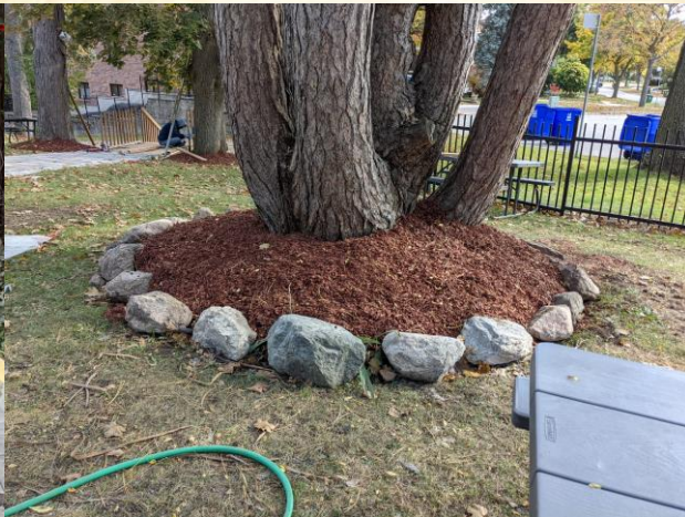
Keeping the magnificent tree healthy by re-mulching the base