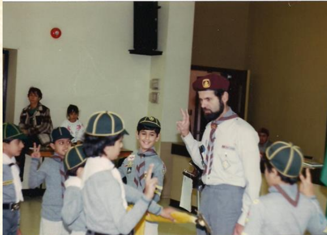
First Cubs invested in the fall of 1990

Affiliated with Scouts Canada, the Group needs a Sponsor and the Board of the ZSO steps up once again and promptly agrees to be the Sponsor of the 100 Toronto Scouts Group and continues to be so to this day. Thank You, ZSO! Very timely that Scouts Canada decides that boys and girls can participate together in the same scout group; and so, we have some 50 plus Zoroastrian boys and girls all participating as “Scouts” of 100 Toronto. (An aside: for good reason, there continues to be an organization “Girl Guides Canada” that is for girls only).