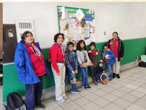
100th Toronto Scouts Apple Day