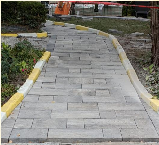
Interlocking was done by the front entrance