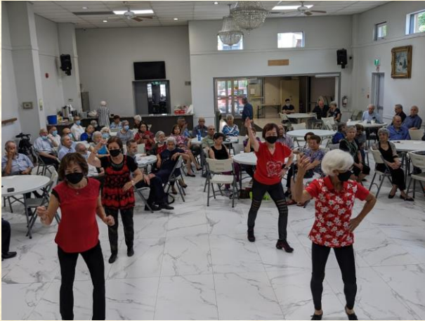
Dancing classes at Seniors Corner