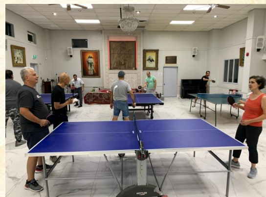
Two play a friendly game of Table Tennis