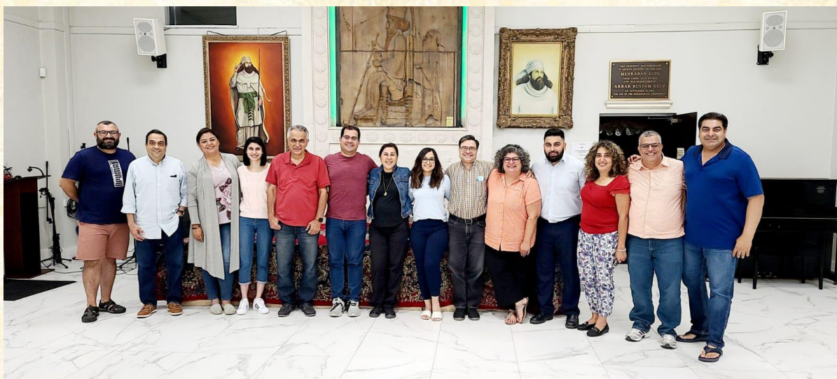
OZCF and ZSO Board members

The Children's Religion Class program runs one to two Sundays per month in two locations, in the East, at the MGDM and in the West (Mississauga - location to be determined). Classes in the East end run from 2:45-5:00 p.m. and classes in the West end run from 11:30 a.m. - 1:30 p.m. For any questions, please email the Children's Religious Committee at crc@zso.org