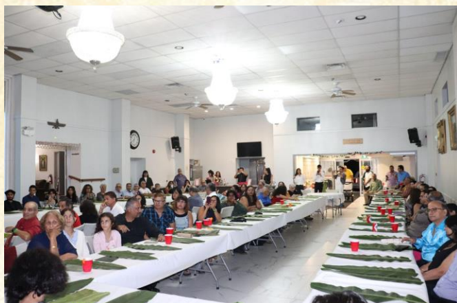
Guest seated, eager to begin their Patra Nu Dinner

The ambiance of the event began to take shape. The attendees consisted not only of Zoroastrians but also of curious foodies, and people around the city who had never had a traditional Parsi dining experience like this and wanted to see what it was all about.