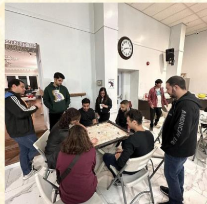
Youth bonding over a carrom game