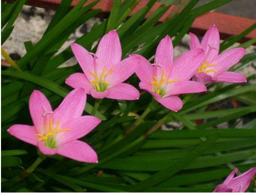
گل سوسن - نماد جشن خوردادگان

ای فدای هستی بفش، ما فروغ توانای تو را که در پرتو راستی فروزان است فواهانیم. آن شعله فروزانی که ابدی و نیرومند است و پیروان راستی را آشکارا، رهنمون گشته و یاری می‌بفشد. ای فداوند فرد همین شعله فروزان است که پلیدی نهفته در نهاد بدفواهان را آشکار می‌سازد.