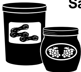
ACHAR JAMS CHUTNEY