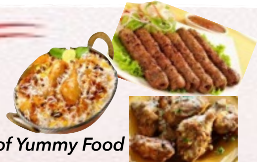
Lots of Yummy Food