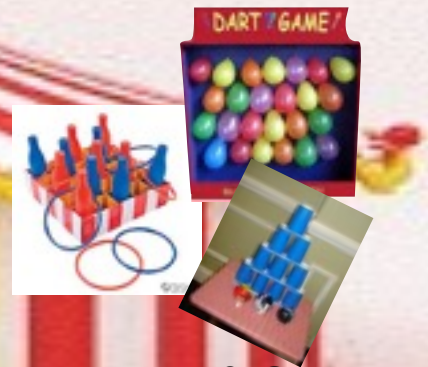
Fun & Games

*Games *Craft *Competition *Face Painting *Henna & Much more