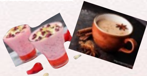
Hot & Cold Beverages