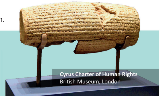
Cyrus Charter of Human Rights British Museum, London

THIS SHOWS THE IRANIANS KNEW OF THE MOVEMENT OF THE EARTH AROUND THE SUN OVER 2000 YEARS BEFORE GALILEO