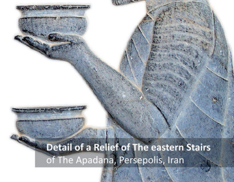
Detail of a Relief of The eastern Stairs of The Apadana, Persepolis, Iran

براستی آن اشما که سرچشمه گرفته، از منش نیک و پیش از این شناخته نشده میان دانایان و در هستی از آن است که راهنمایی خوب پدید می آید که هرگز به کاستی نمیرود و می افزاید پارسایی را و ما را بسوی رسایی راهنمایی میکند زرتشت گات ها - یسنا - هات ۲۸ بند ۳ (ف ر)