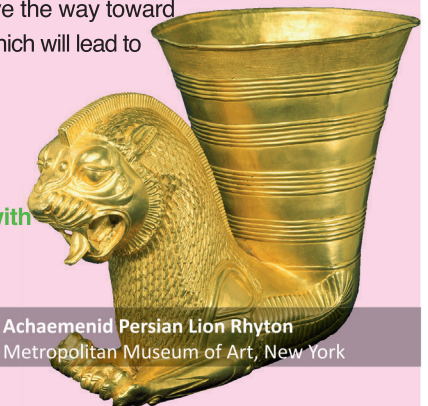
Achaemenid Persian Lion Rhyton Metropolitan Museum of Art, New York