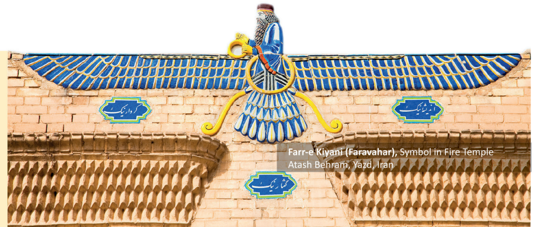
Farr-e Kiyani (Faravahar), Symbol in Fire Temple Atash Behram, Yazd, Iran

اینک جستجو می کنیم با پاس گزاری با برافراشتن دستها رسایی منش خرد را نخستین نیک افزای اشا همه بکوشیم نیک بآفرینیم با خرد اندیشی تا بدست آوریم هم سازی در جهان هستی و روانی زرتشت گات ها - یسنا - هات ۲۸ بند ۱ (ف ر)